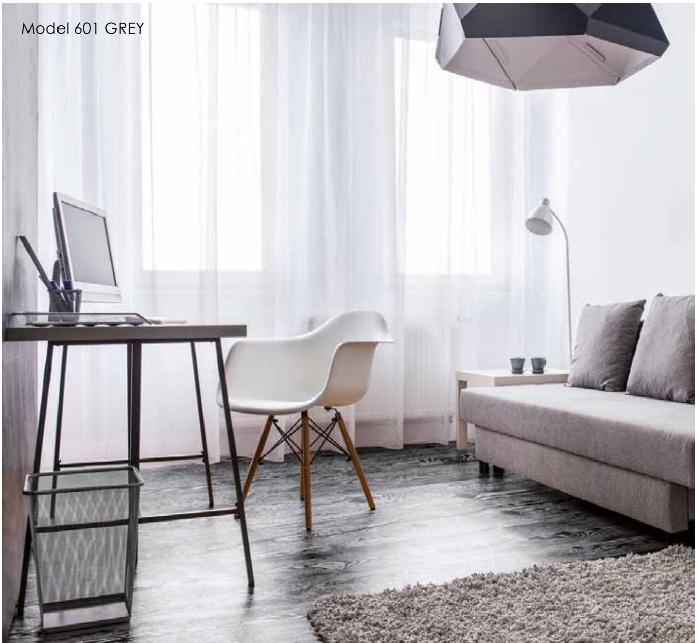
Model 601 GREY

Further models can be found on our homepage at: www.stainer-sunwood.com