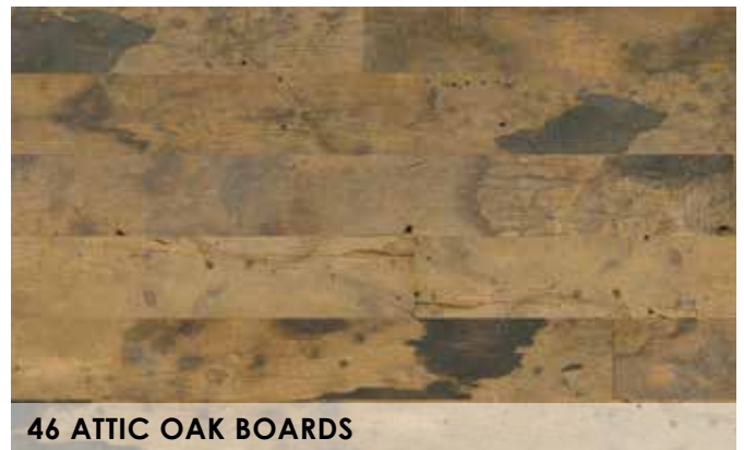
46 ATTIC OAK BOARDS