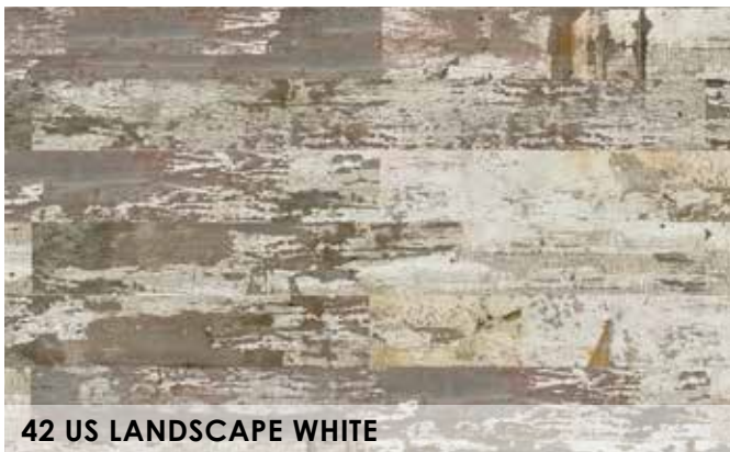
42 US LANDSCAPE WHITE