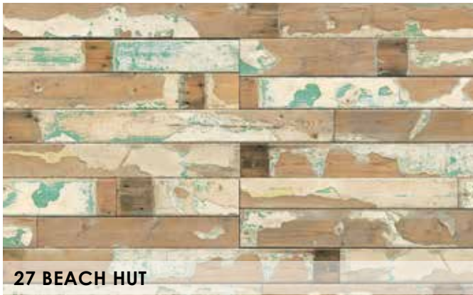
27 BEACH HUT