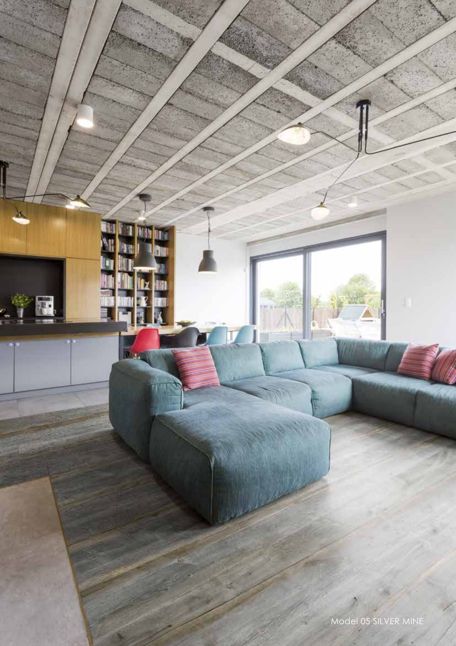
Model 05 SILVER MINE