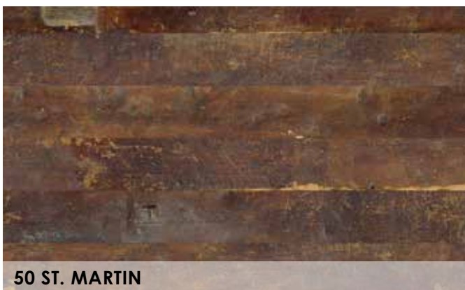
50 ST. MARTIN

Further models can be found on our homepage at: www.stainer-sunwood.com