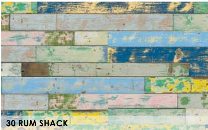
30 RUM SHACK