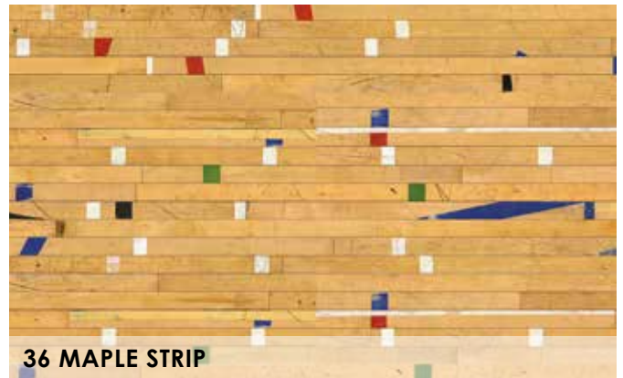
36 MAPLE STRIP