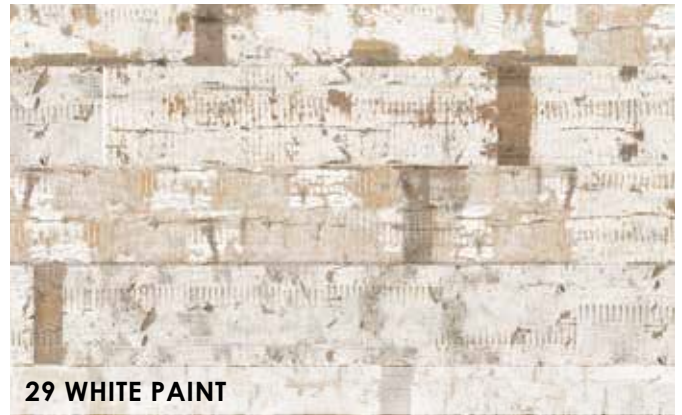
29 WHITE PAINT